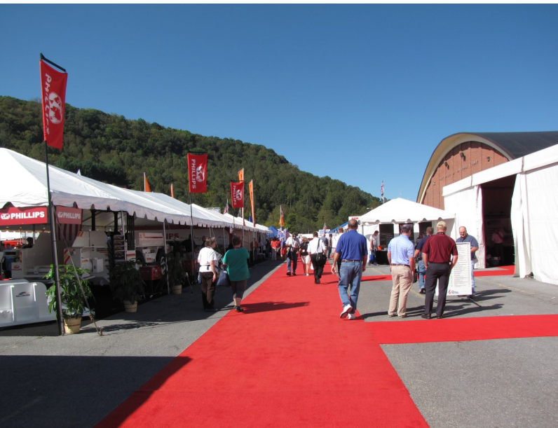
Outside Exhibits in Sunshine

September 17, 2015 -The beautiful fall weather continued, and visitors poured into the Bluefield Coal Show to examine the wide selection of products and services on display from the many manufacturers. Attendance on the opening day was considerably higher than anticipated considering the challenges the coal industry faces. More than 230 exhibitors came from 30 states, the United Kingdom and Canada, all showing their confidence in the coal industry in spite of the challenging times. Technical Session 2 took place in the afternoon (please click here for details).