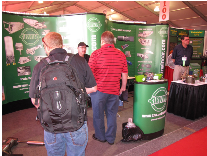
Irwin Car and Supply Co.